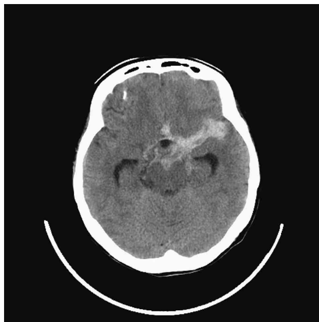
Figure 1. Initial CT showing localization of the subarachnoid hemorrhage.

A 59-year-old female experienced sudden headache and nausea and was referred to our institution 14 hours after the onset. She had a history of hypertension and malignant rheumatoid arthritis that had been adequately controlled by medication. She had no history of diabetes mellitus, heart disease, stroke, or cancer. She had no family history of SAH, and no habit of smoking or alcohol. On arrival, she was alert and well oriented. She had no neurological deficit except for left external/internal oculomotor nerve palsy, including ptosis, pupillary dilatation, and loss of direct/indirect light reflexes. Computed tomography (CT) scans showed a diffuse thick SAH, especially in the left sylvian fissure (Figure 1). Three-dimensional CT angiography demonstrated a small, medially projecting, left MCA bifurcation aneurysm with a maximum diameter of 3.5 mm (Figure 2). No other aneurysms were identified. There were no vessel anomalies including the tortuosity or dolichoectasia